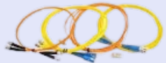
OFC Patch Cord