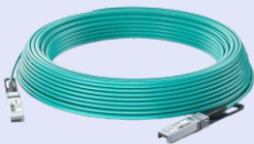
SFP+ AOC Cable