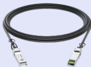
SFP+ DAC Cable