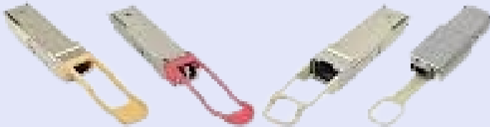
25G QSFP Transceiver